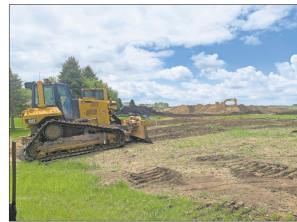
Land being developed as part of the Glenwood Heights Second Addition project is shown Friday, May 21, from the current terminus of Campbell Boulevard.