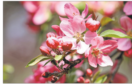
Crabapples in full bloom are pictured west of Worthington in this photo taken last week. The weather will feel summer-like for the next few days, with high temperatures expected to be in the 80s through Tuesday.