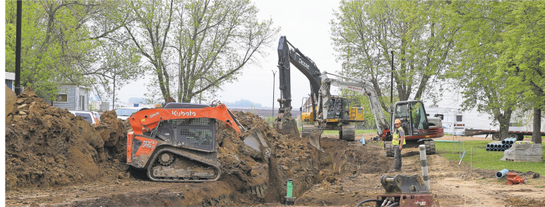
Construction workers upgrade utilities at the southeast end of the Sungold Heights trailer park on Wednesday, May 19.

No. 41 Unlock digital at dglobe.com/activate